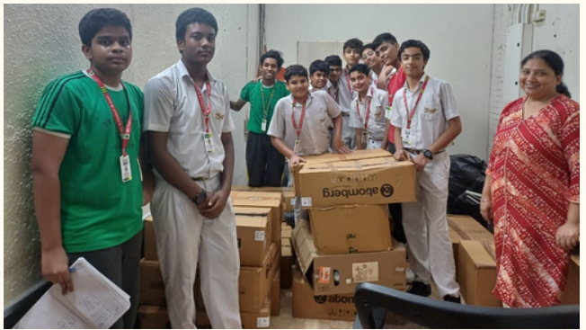
Columbans packaging the donated grains.

The drive not only provided essential supplies but also instilled values of empathy and social responsibility in students. It offered a practical lesson in giving and service, inspired by the teachings of the school's Blessed Founder, Edmund Rice.